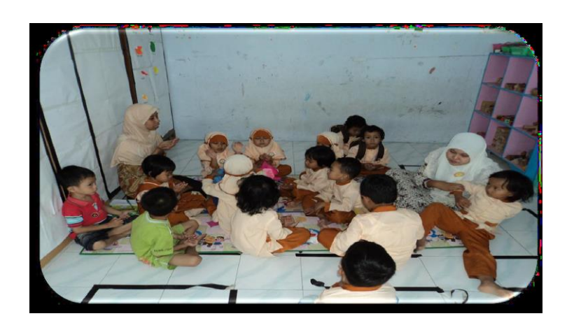
Figure 4.1 Say a prayer before and / or after doing something

Based on the results of interviews and observations above, it can be concluded that there is a deliberate application of discipline carried out by the teacher in the form of saying prayers before and after doing something, memorizing short letters, studying iqra', memorizing Arabic vocabulary and praying' a daily each day with the teacher reciting the verse first and then the children follow it. in this activity, children are able to reach the realm of good character development in the realm of carrying out worship activities according to rules according to belief.