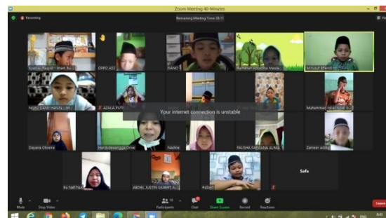
Gbr. 1 Proses Interaksi Akademik

Efforts made in following up on obstacles, namely the teacher patiently waiting for the results of student work until the oneweek deadline. Regarding the limited internet quota, thankfully, students get help from the Ministry of Education and Culture. For students who cannot go online, the teacher sends materials and assignments that students can get.